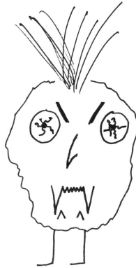
Figure 1.3: The Big Bad Bolzano-Weierstrass Theorem.

held. Soon afterwards, at t = T_1 , the Big Bad Bolzano-Weierstrass Theorem reached the boundary at \Gamma 's domain. However \Gamma 's domain was compact and thus by the Heine-Borel theorem it was closed and bounded. 4