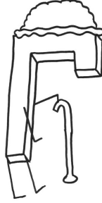
Figure 1.2: \varepsilon -Red Riding Hood's \Gamma .

“Well in that case Q.E.D.” concluded the Big Bad Bolzano-Weierstrass Theorem, and with that he commuted off into the forest. The Big Bad Bolzano-Weierstrass Theorem was able to map himself into \mathbb{C}^n and thus approached \Gamma 's domain in a way such that