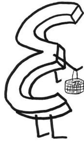
Figure 1.1: \varepsilon -Red Riding Hood with her basket of lemmas and \pi .

Once upon a time 1 a long long time ago back when Fermat's Last Theorem would still fit in a margin, \exists a little 2 girl named \varepsilon -Red Riding Hood (see Figure 1.1). \varepsilon -Red