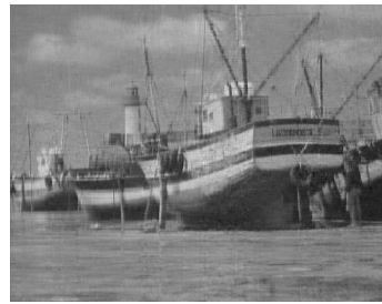
(d) recovered image by PD