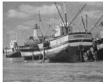
(h) recovered image by PD