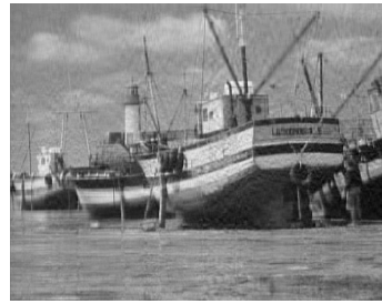
(f) recovered image by PD