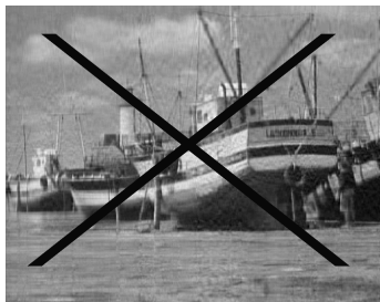
(g) 6.34% masked rank 40 image