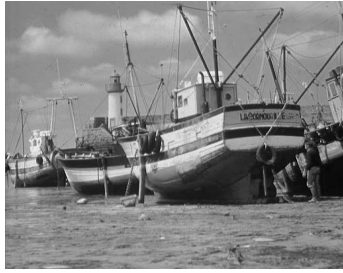
(a) original image